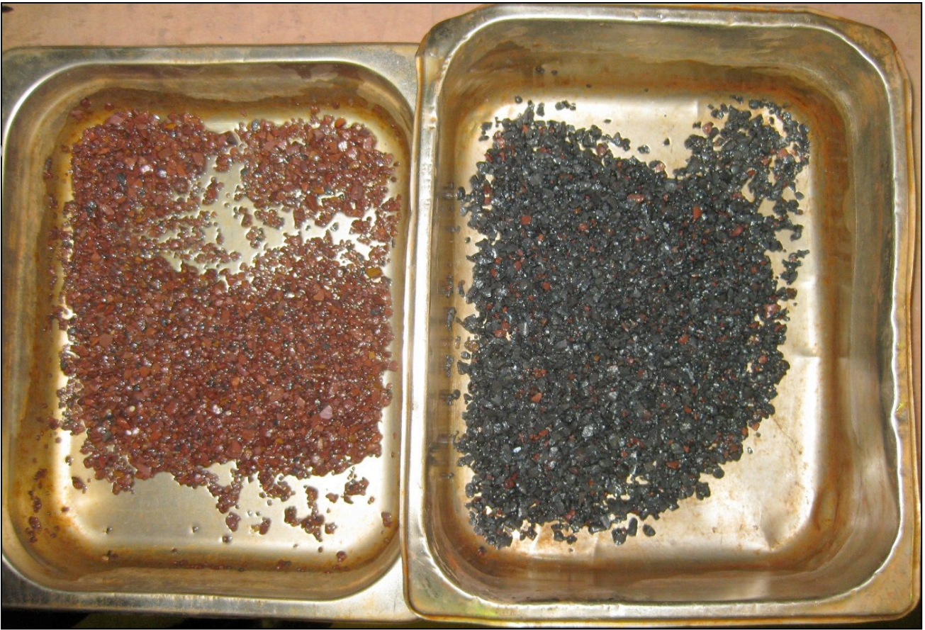
Figure 2: Composite 208-2, DMS Tail on left, DMS Concentrate on right.